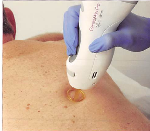
Gentle Pro lasers remove unwanted benign pigmented lesions anywhere on the body.

Gentle Pro™ devices incorporate state-of-the-art technology to deliver short pulses of light energy into the skin. The light energy is absorbed disproportionately by the concentration of pigment which forms the unwanted lesion. This selective delivery of laser energy destroys the excess pigment and fades the lesion, but remarkably leaves the surrounding tissue unaffected. This is the brilliance of laser light.